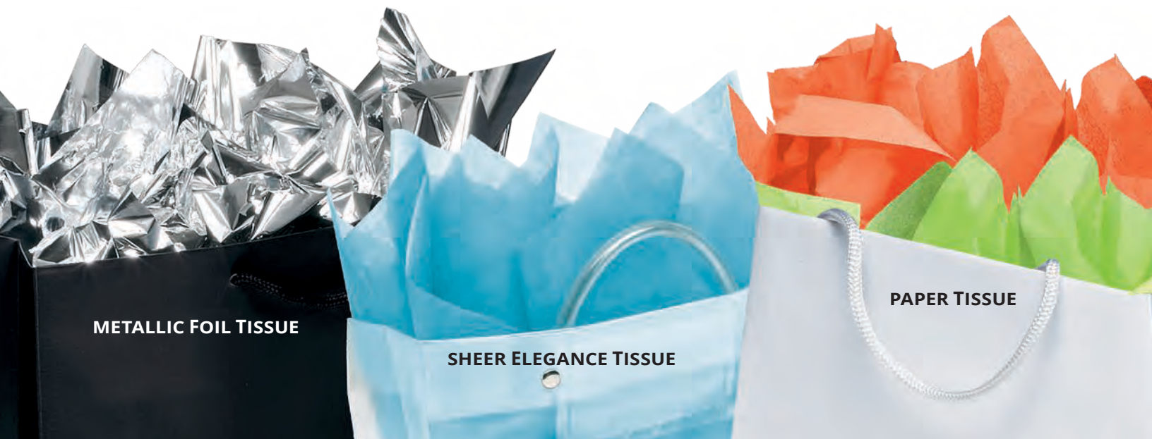
METALLIC FOIL TISSUE

Create even more impact with custom-printed tissue through our Design Centre! See page 185.