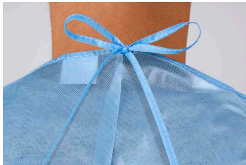
String-Tie Neck Closure