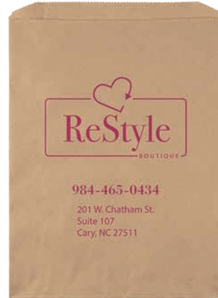
FLEKO INK PRINT 9 X 12