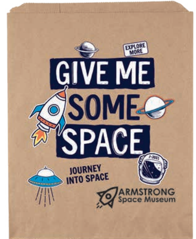
COLOR VISTA 11 X 13¼