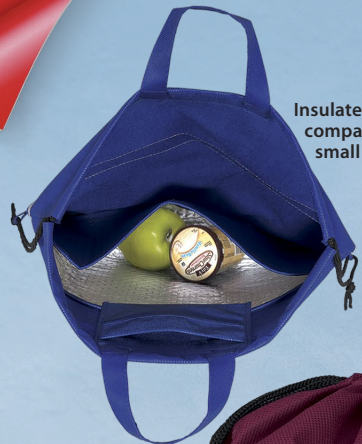
Insulated interior compartment and small utility pocket