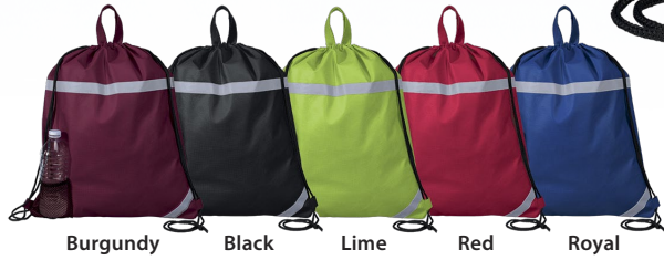
Burgundy Black Lime Red Royal