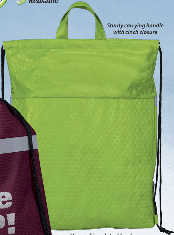
Sturdy carrying handle with cinch closure