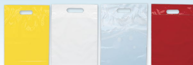
Yellow White Clear Red