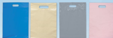
Blue Buff Gray Pink